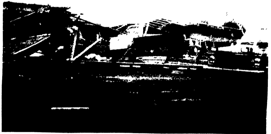
This is one of the scenes the family faced when they walked out of the basement on that fateful day, May 31.