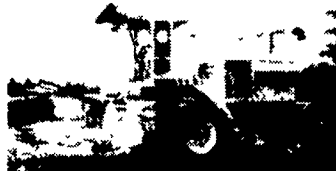
N.H. 2115 Forage Harvester, 4WD, 960 Hours, N.H. 360 N4 4-Row Corn Head, N.H. 340W Windrow Pickup, Real Sharp