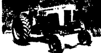
Case 831 Tractor, 65 HP, Good Rubber