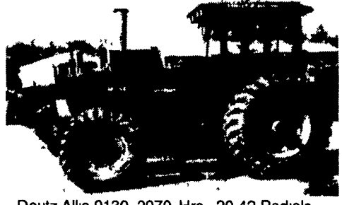
Deutz Allis 9130, 2070 Hrs., 20-42 Radials — $31,000