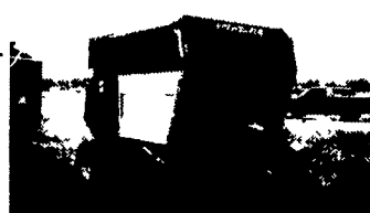
NH 855 Round Baler 1984 One Owner, 5 1/2'x5 1/2' Bale