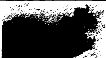
Series 5000 Field Cultivator