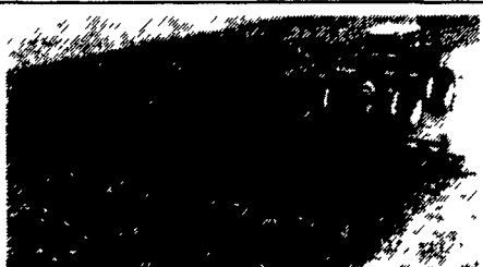
Series 6000 Land Finisher