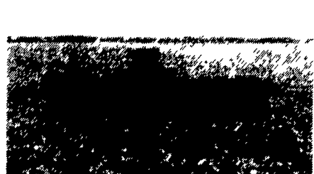
Series 9000 Grain Drills

"Boiling" uplifting action in the soil allows water to enter and be retained in subsoil minimizing runoff. Yield increases up to 10 bu. more corn per acre." Lancaster Co. farmer