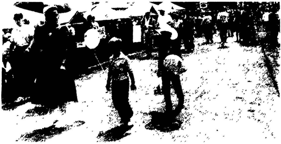
Hurrying down the street, these visitors are eager to cover as much ground as possible at Ag Progress.