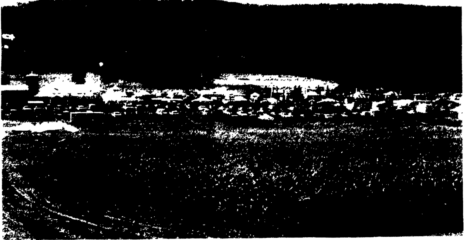
A view of Ag Progress Days exhibit field.