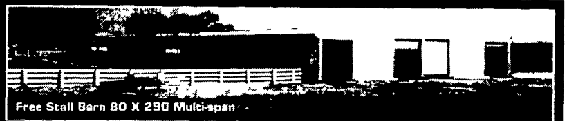
Free Stall Barn 80 X 290 Multi-span