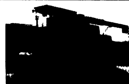
1984 MF 860 4x4 Combine Ser # 18839 2,478 Hr $18,000

COMING IN Claas 840 4x4 381 HP Harvester 1996