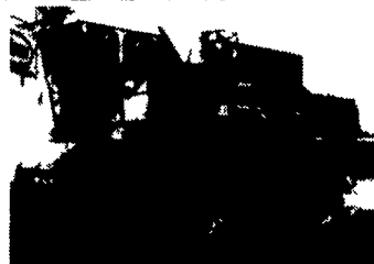
1990 MF 8460 Combine with Hillside Cleaning, 20 Ft Floating and 6 Row Corn Head, 2189 Hrs. $67,000

COMING IN Claas 840 4x4 381 HP Harvester 1996