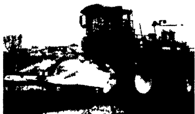
Just Traded - 96 JD 6710 Harvester 4x4 Corn Cracker Hay Head, 4 Row Kemper, 509 Hrs. $148,000

Discover CLAAS THE HARVESTING SPECIALIST