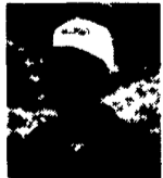
DOUG FILSINGER Farrow to Finish Hog Operation Bluevale, Ontario Corn/Bean Rotation

With less time spent in the field I am able to spend more time with my Hog Operation. The AerWay blends perfectly with my Conservation and Environmental Farm Plan.