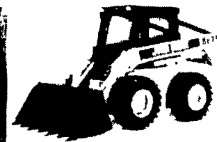
• 8875 61-horsepower, 3-cylinder diesel engine SAE operating load - 2,352 pounds In Stock!