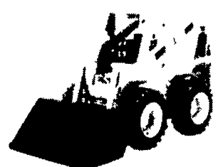
• 3375 17-horsepower, 3-cylinder diesel engine SAE operating load - 700 pounds In Stock!

John Deere skid steers are powered by John Deere diesel engines. And that means better overall performance, quiet operation, and unsurpassed reliability.