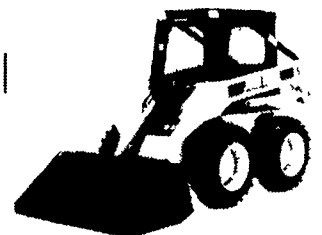
• 5575 37-horsepower, 3-cylinder diesel engine SAE operating load - 1,410 pounds