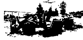
Kubota R400 Loader w/3 Pt Hitch Kelley Trencher Pallet Forks & Bucket