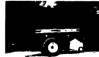
NH 2000 Baler, 3'x4'x8' Bale Real Sharp