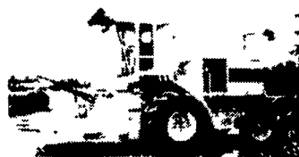
N.H. 2115 Forage Harvester, 4WD, 960 Hours, N H 360 N4 4-Row Corn Head NH 340W Windrow Pickup, Real Sharp