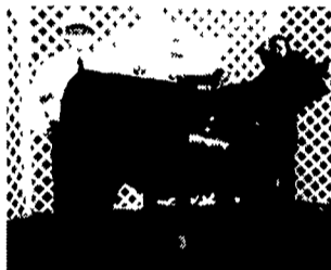
Grand Champion Steer

Marvin Stoltzfus' herd has averaged 111 pounds of milk per day for the last nine months.