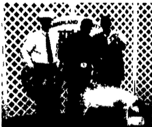
Grand Champion Hog