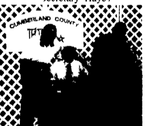
Grand Champion Lamb