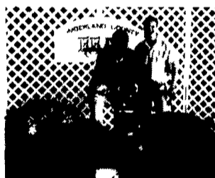
Champion Pen of Market Hogs