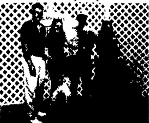
Champion Pair of Lambs