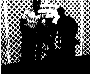
Grand Champion Goat