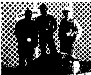
Reserve Grand Champion Hog