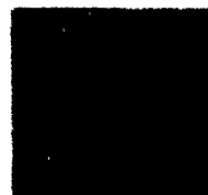
Before A hole is worn completely through the silo wall