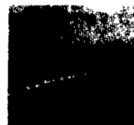
Before The bottom part of the stave's are completely worn away