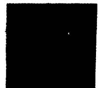
After The ShotCrete System repairs and replaces the missing structure

Two 20' Hanson Ringdrive Unloader w/Power Winches One 20' Patz Ringdrive Unloader w/Power Winch One 20'x60' Lancaster Used Silo One 14'x65' Ribstone Silo