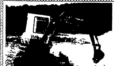
Komatsu PC28 Mini Excavator, Excellent Rubber Tracks, Side Shift Boom, Back-Fill Blade, 1200 Hrs ..... $11,500