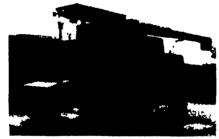
1984 MF 860 4x4 Combine Ser # 18839 2,478 Hi $18,000