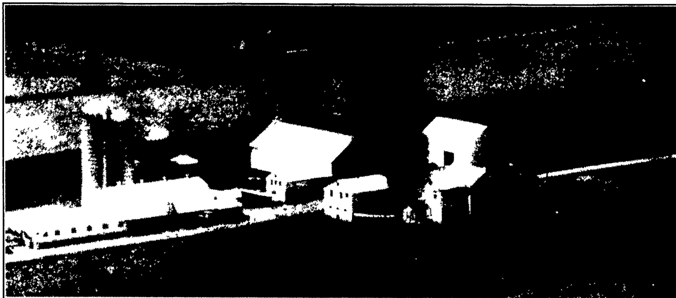
Marvin R. Stoltzfus, East Eby Road, Leola, PA