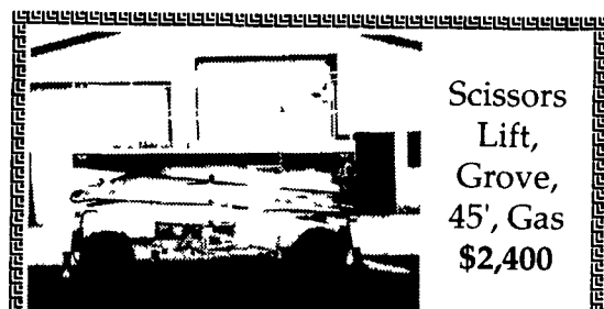
Scissors Lift, Grove, 45', Gas $2,400

Rosco Mod #BH8 Mobil Broom w/Cab $7,500 1988 MEC Mod #220TMI, 22' Scissor Lift $4,500 1995 Stratolift Mod #KRX20 20' Scissor Lift $7,500 1995 Dig-It Tractor Loader Backhoe, 18 HP $8,995 1994 Terramite Tractor Loader Backhoe, 20 HP $9,500 1989 Mod #10-10 Ditch Witch 3' Boom $2,600 Smith 160 CFM Air Compressor, Gas $2,995 (814) 658-3066