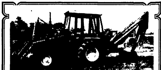
Int Tractor Loader Backhoe Diesel, Full Cab