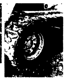
Steel tracks improve performance in delicate or poor traction areas Fit 4475 through 8875 Skid Steers