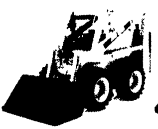
• 3375 17-horsepower, 3-cylinder diesel engine SAE operating load – 700 pounds In Stock!

John Deere skid steers are powered by John Deere diesel engines. And that means better overall performance, quiet operation, and unsurpassed reliability.