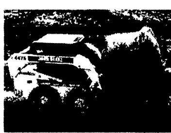
• BALE SPEAR. Lifts and easily carries round bales up to 5 feet wide Tapered design reduces drag resistance on removal from bale Fits 4475 through 8875