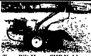
Troy-Bilt Horse 8HP Kohler w/Generator, New $1,695

Route 194 and Brown Road 410-751-1500 Bush Hog® King Kutter Toll Free 877/751-1500