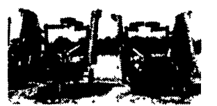
Bush Hog 2615 Flex Wing Mowers Prices starting at $7,995