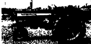
Int. 656, Good Rubber, Straight Tin Work, Tight Tractor $3,995