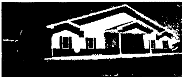
Milking Center and Free Stall Barn