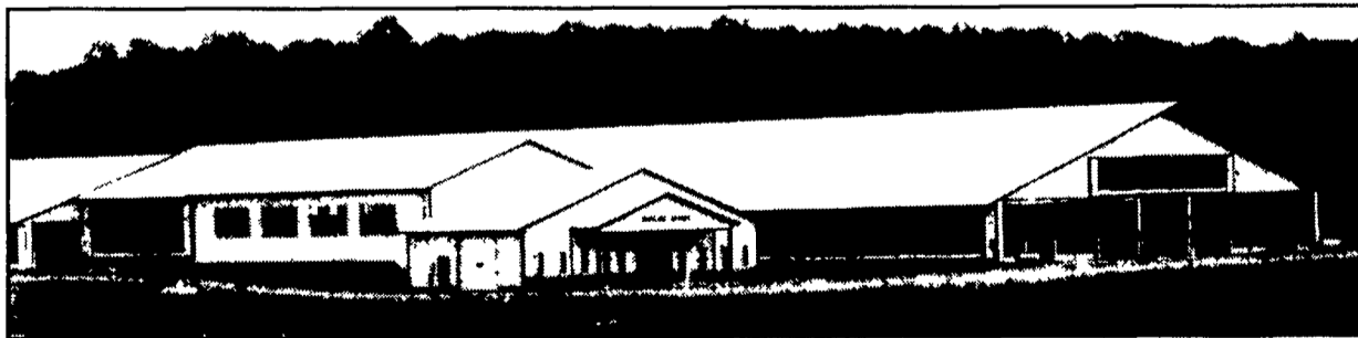
450 Cow Free Stall Barn & Milking Center

See us for any new projects and have Triple H Construction design and construct your new facility.