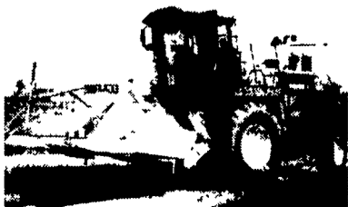
Just Traded - 96 JD 6710 Harvester 4x4 Corn Cracker Hay Head, 4 Row Kemper, 509 Hrs $148,000

Massey Ferguson* is a wholly owned subsidiary of AGCO Corporation, Duluth, GA