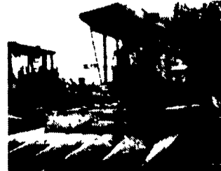
New Holland 2115 4x4 6-row Corn 1200 HR $98,000