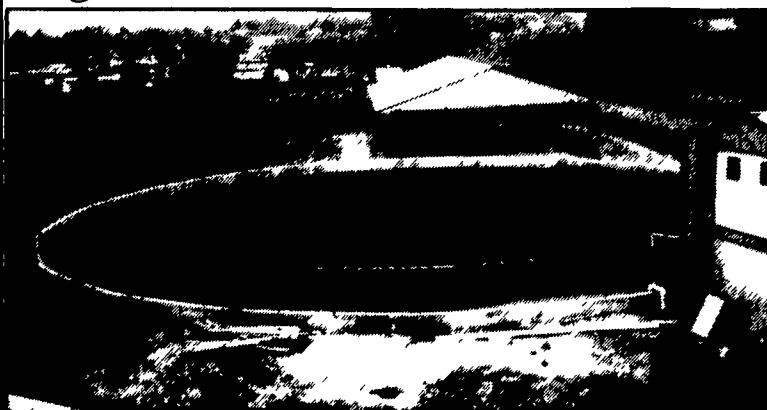
Partial In-Ground Tank Featuring Commercial Chain Link Fence (5' High - NRCS Approved)