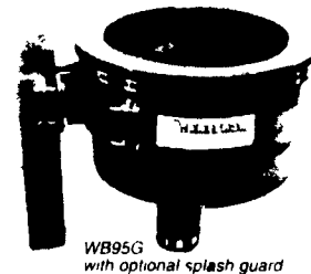
WB95G with optional splash guard