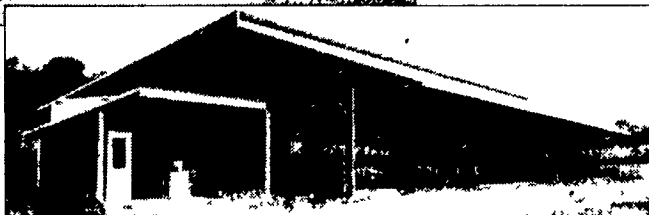
OPEN-SIDED HEIFER FACILITY