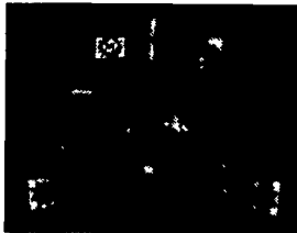
4' x 6' Playhouse with Deck