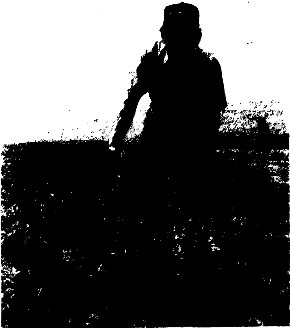
Last year's spring-seeding measured 29 inches the beginning of June. Hostetter's first cutting of alfalfa haylage last year tested 20.9 percent protein.