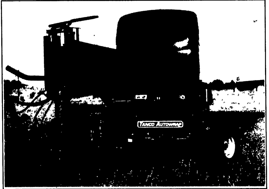
It takes a quality product to do quality work.

Patented advantages like the unique "Deep Cradle" continuous full width belt, and fully supported turntable where four polyurethane wheels provide Tanco's renowned even and balanced operation, even with overweight and misshapen bales. Quality wrapping and quality machines that has made Tanco among the World's leading manufacturers.