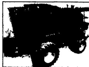
20963 CIH 1680L 2WD, 1990 2300 Hours, 30 5x32 DT, SP Rock Trap Chopper, Field Tracker