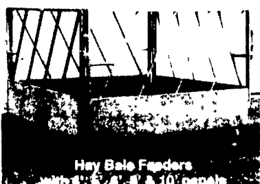
Hay Bale Feeders

Feed Big Round & Regular Bales or Stacks