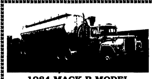
1984 MACK R MODEL 1980 Clark bulk Feed trailer with 40 foot Stinger - 8 Compartment. Good condition $15,900 Call 717-653-8783 Monday through Friday between 7:00 to 4:30 P.M.

1995 Ford LTL 9,000 Tri-Axle, 19' Aluminum Body, 460 Cummins, 8-LL Trans. 46,000/Rears. 170,000/Miles. Factory Warranty Remaining. MINT CONDITION. $79,000. (814)267-5108. 1995 Int. flatbed trailer, 8x18, beavertail & ramps, 12,000 GVW 2 axles, excellent condition, $2200 OBO. 609/358-4781 leave message.