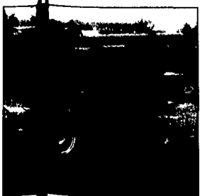
13 CIH 1660 2WD, 1989