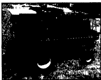
U1001 IH 1480 2WD, 1983, w/ Specialty Rotor