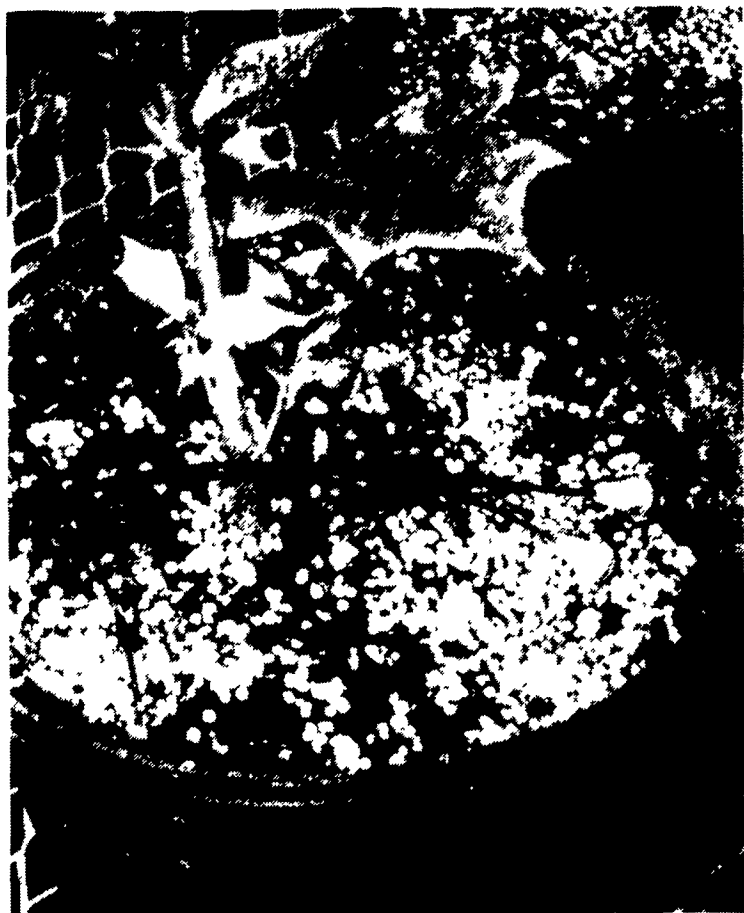
There are four tubes running to all the 8-inch pots.

Almost all of the current Agriculture club members who raise farm animals participate as part of cooperatives at the 4-H Farm and Center at the Garrett Williamson Foundation in Newtown Square. This enables suburban children to learn animal science, develop responsibility, practice teamwork and, for experienced members, to guide the learning experience of new members.