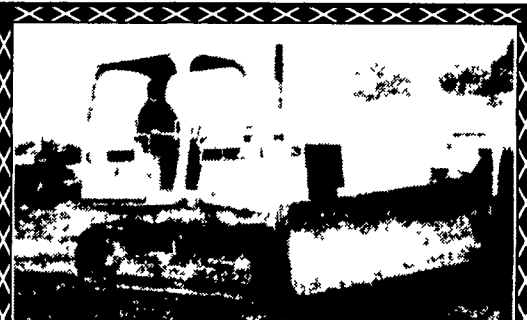
1988 John Deere 450G Pat Dozer $30,000

205 CAT track hoe, 1988, good condition, $29,500. (610)273-2946.