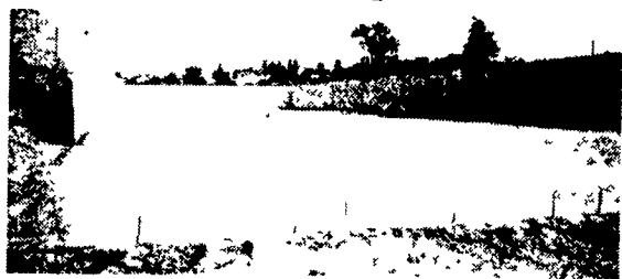
You can load a ton a minute with loader Feed faster Less cost and maintenance with a bunker