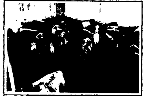
Slatted Beef Barn