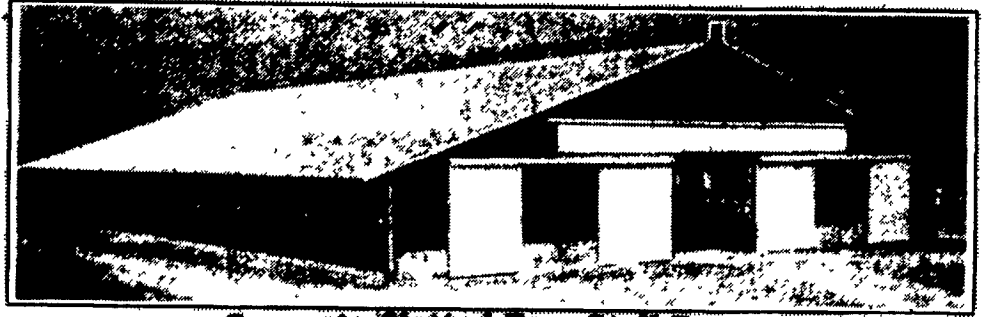
Concrete Slatted Free Stall Barn