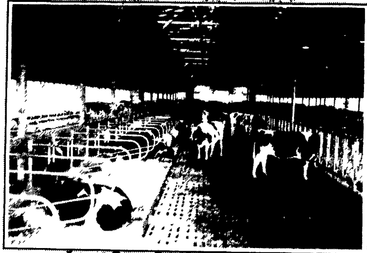
Long Core Cattle Waffle Slats