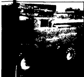
15389 JD 7720 4WD, 1987