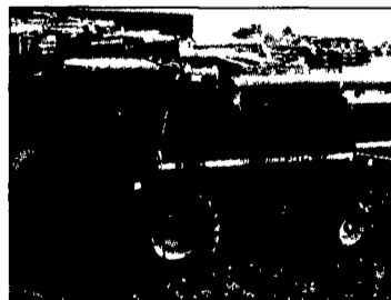
15295 JD 9500 2WD, 1991