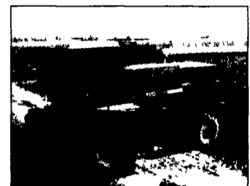
15633 JD 7720 4WD, 1984