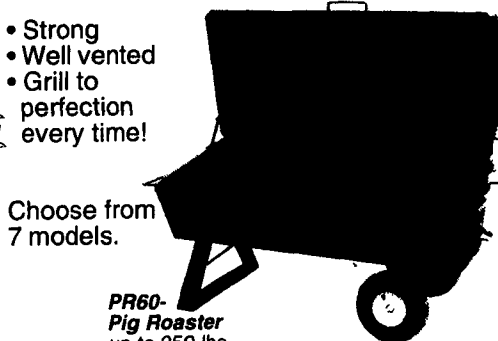
PR60-Pig Roaster up to 250 lbs