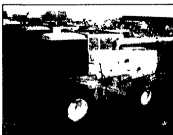
15281 JD 7720 4WD, 1981 $11,500

WE'LL SHIP TO THE HOOBER LOCATION NEAREST YOU!