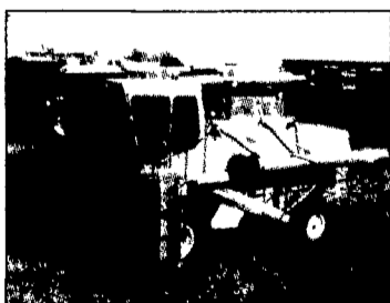
15158 JD 6600 2WD, 1975 $3,900