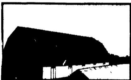
Use on Barns Or Garages