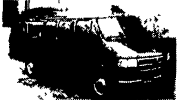
94 DODGE RAM 3500 Handicap Van, V8, AT, Dual A/C & Heat, Wheelchair Lift, 79,000 Miles, Dk Blue