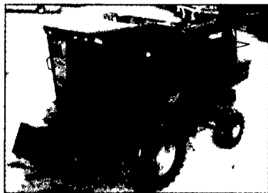
20426 CIH 1660 2WD, 1986 Specialty Rotor Rock Trap