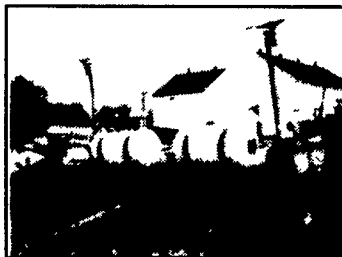
4 Row With Monitor, Liquid Fert. With Squeeze Pump

Plant Soybean With This Nice John Deere 7200 Conservation Maximerge Planter