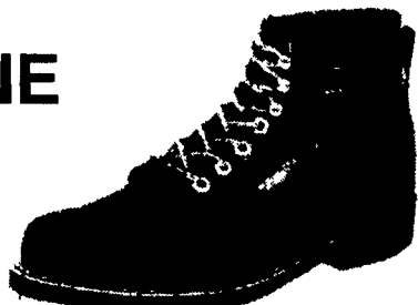
6 inch style 344