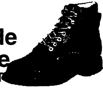
6 inch style 346