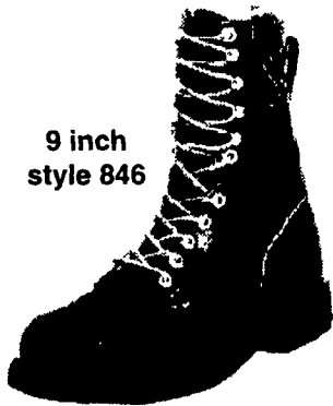
9 inch style 846