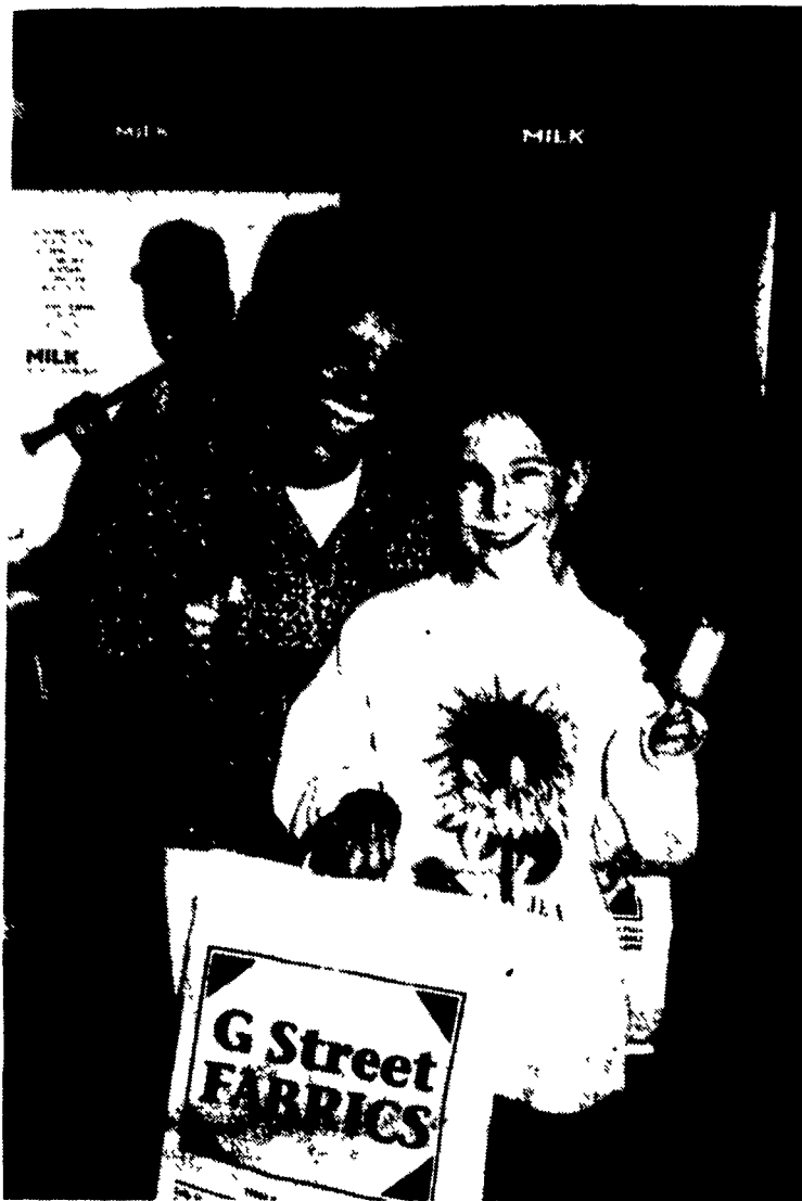
Moms and daughters got to pose together bearing their milk mustaches.