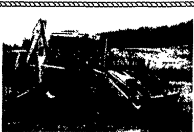
88 JCB 1400B, 4x4 Cab, 3000 One-Owner Hrs. Good Rubber.....$19,500