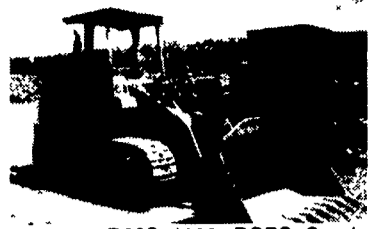
Komatsu D66S, 1988, ROPS, Good Condition .....$29,500