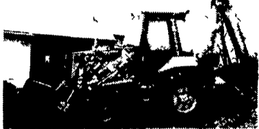
89 Case 680L 4x4, Cab, Ext. Hoe, 2800 Hrs., Good Rubber, New Paint.....$34,000