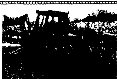
94 Case 580 Super K 4x4, Ext-Hoe, New Rubber, 3300 Hrs. Wobble Stick Controls....$34,500

NICE PACKAGE! 1971 Mack dump 237, 5 speed power steering, 12 ton General trailer, 125C Int track loader. All in excellent condition, $20,000. (215)598-3528