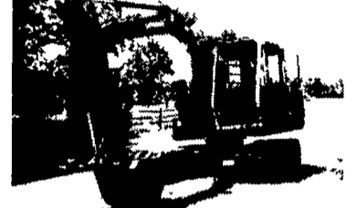
Hitachi EX60 Excavator, 3300 Hrs... ..$19,500