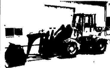
Cat IT 18B w/Rockland Log Forks w/Thumb, Material Bucket, New Paint.....$39,500

Jay Weaver - 717/336-7375 Financing and Lease Purchase Available No Sunday Calls