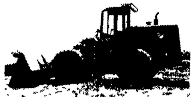
JD 554D, New Paint.....$29,000