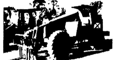
Lull 844, Good Running gas Engine, New Paint, Ready To Work .....$19,500