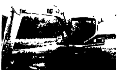
95 Cat 311 Excavator, 1800 Hrs .....$49,000