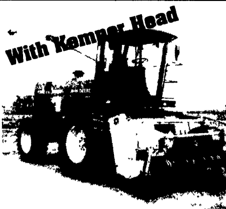
JD 6910 4WD, SP Chopper, 6 Row Kemper Head, 10 Ft. Hay Head, Corn Cracker.....$179,000