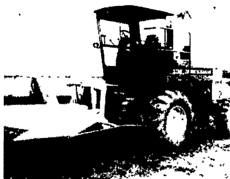
JD 5720 3R Corn, 7 Ft. Hay, Good Condition!.....$44,900