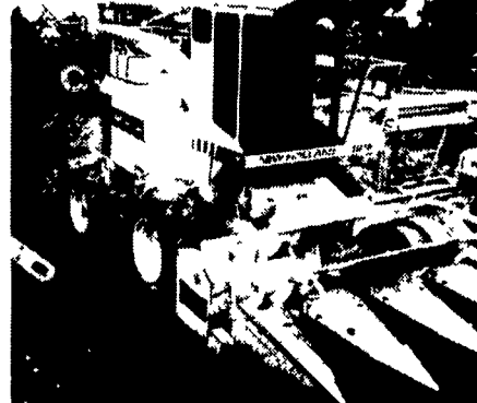
NH 1915 S.P. Chopper w/4 RN & Hay, 2084 Hrs., 1989, Hydr. Kit & Hitch, Auto Knife Sharpener...$69,900