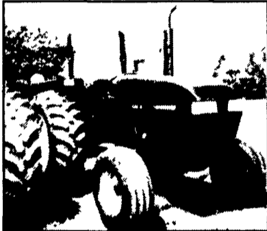
Model C 60

New state-of-the-art engine technology which meets all current emissions legislation! Easy cold weather start, self-adjusting self-equalizing wet disc brakes, also self-adjusting hydraulic clutch.