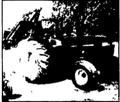
Model C 100