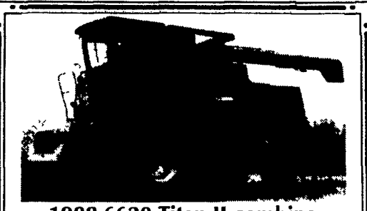
1988 6620 Titan II combine 2905 hrs., dial-a-matic, tire size 28x26, field ready, very nice, 1 owner machine $30,500 717-933-9186

King's Tractor 1426 Noble Road, Kirkwood, PA 17536 717-629-2943 8 am to 8 30 am