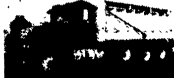
1995 MACK MODEL RD688S TRIAXLE DUMP TRUCK 400 E7 Engine, 8L Eaton Trans., 16x44 Axles Air Ride Suspension, Hwy 17 Ft Heated Aluminum Body With Air Gate Vibrator And Roll Tarp, 52,000 Original Miles