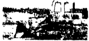
1995 CAT 953B TRACK LOADER With Full Cab, 21/2 Cubic Yard Bucket 2950 original hours

ALL THIS EQUIPMENT WAS BOUGHT NEW BY BLUE LAKE BUILDERS