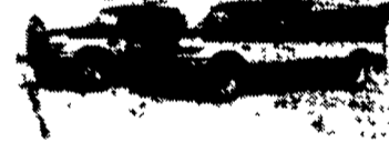
1993 F-150 XLT 4 WD FORD PICKUP Auto, 115 000 Miles 1994 F-250 XLT 4 WD FORD PICKUP Auto 121 000 Miles