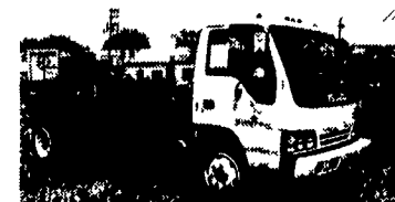
98 & 99 Isuzu NPR & NQR Cab & Chassis Arriving Daily, New Models