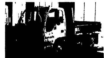
1998 ISUZU NPR HD GAS, 250 HP V8, Auto, A/C AM/FM Cass, 14,050 GVW, 10' Omaha Dump